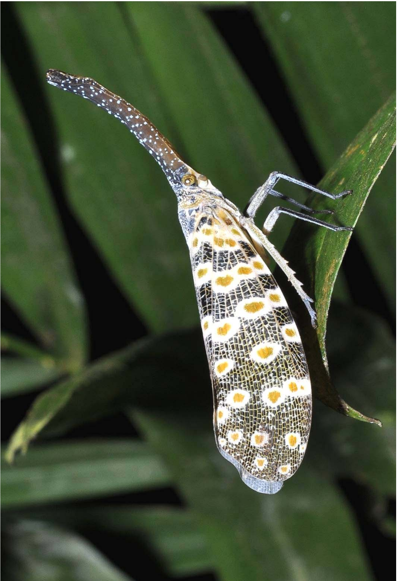
Fig. 2. Lateral view of Laternaria oculata (as in Fig. 1).