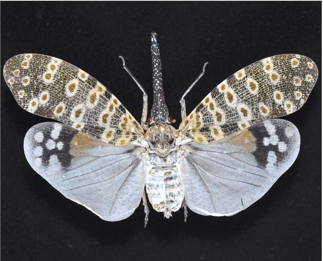
Fig. 3. Dorsal view of Laternaria oculata (as in Figs. 1, 2; ZRC.6.21653, forewing length: 35 mm, head length: 21 mm), with wings spread to reveal hindwing patterns. (Photograph by: Tzi Ming Leong).