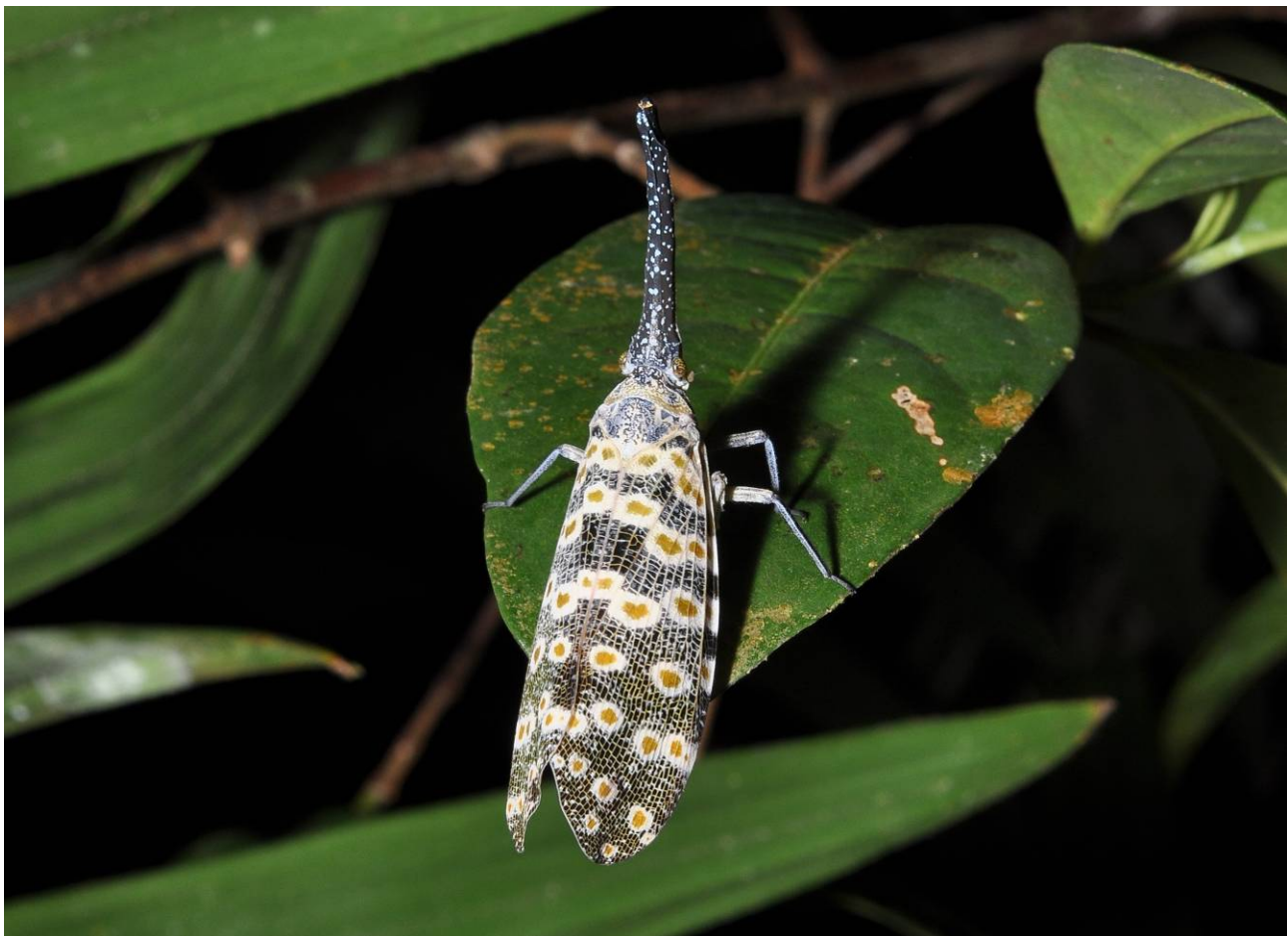
Fig. 1. Dorsal view of Laternaria oculata , encountered on the night of 29 Aug.2009 at Nee Soon Swamp Forest. (Photograph by: Tzi Ming Leong).

Members of the genus Laternaria Linnaeus, 1764, possess a pronounced anterior elongation in their heads and have often been commonly referred to as lantern bugs or lantern flies, as many species exhibit bright red/orange colours at their bulbous tips, bearing resemblance to a glowing torch or lantern. The type species for this genus is Laternaria candelaria (Linné, 1758), and Laternaria currently contains 59 species, which has a predominant Australasian distribution (Bourgoin, 2009). Until recently, the generic name of Pyrops Spinola, 1839, was widely applied to its members (Nagai & Porion, 1996, 2002, 2004), but it is apparent that Laternaria has priority and has been increasingly adopted (Hua, 2000; ZSM, 2005; EOL, 2009). In this article, recent field encounters and early museum records of Laternaria oculata (Westwood, 1839), in Singapore are presented. A historical record of another closely related fulgorid, Zanna nobilis (Westwood, 1839), (subfamily Zanninae) and its possible local extinction is briefly discussed.