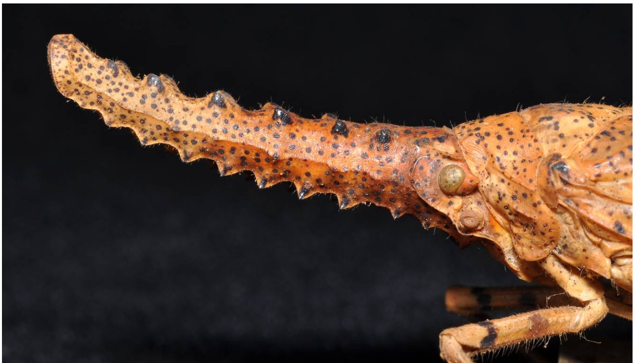
Fig. 8. Lateral close-up of elongated head of Zanna nobilis (ZRC.6.540).