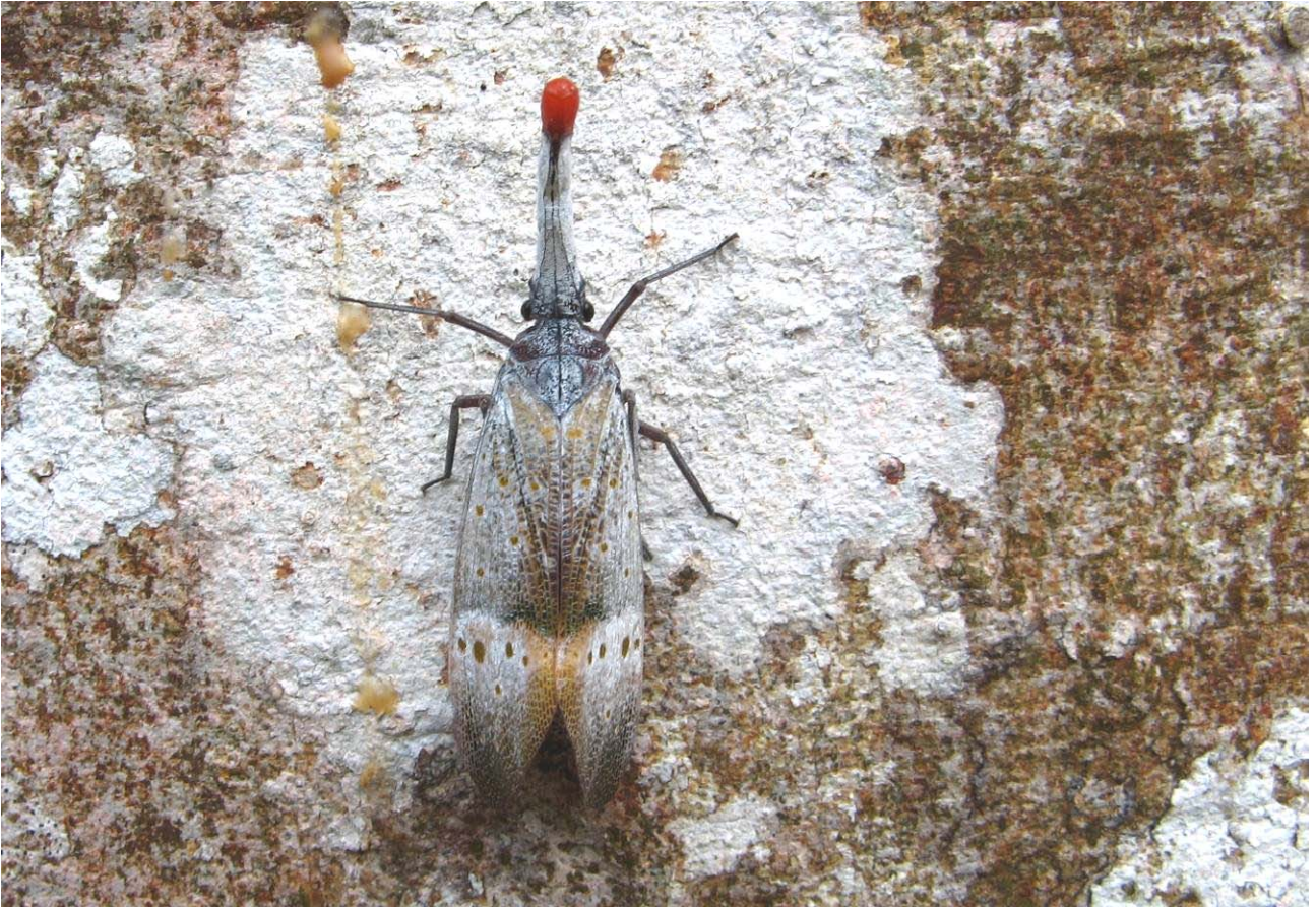
Fig. 5. Dorsal view of Laternaria ruhli , encountered in a forest reserve in Johor, Peninsular Malaysia on 1 Aug.2006.