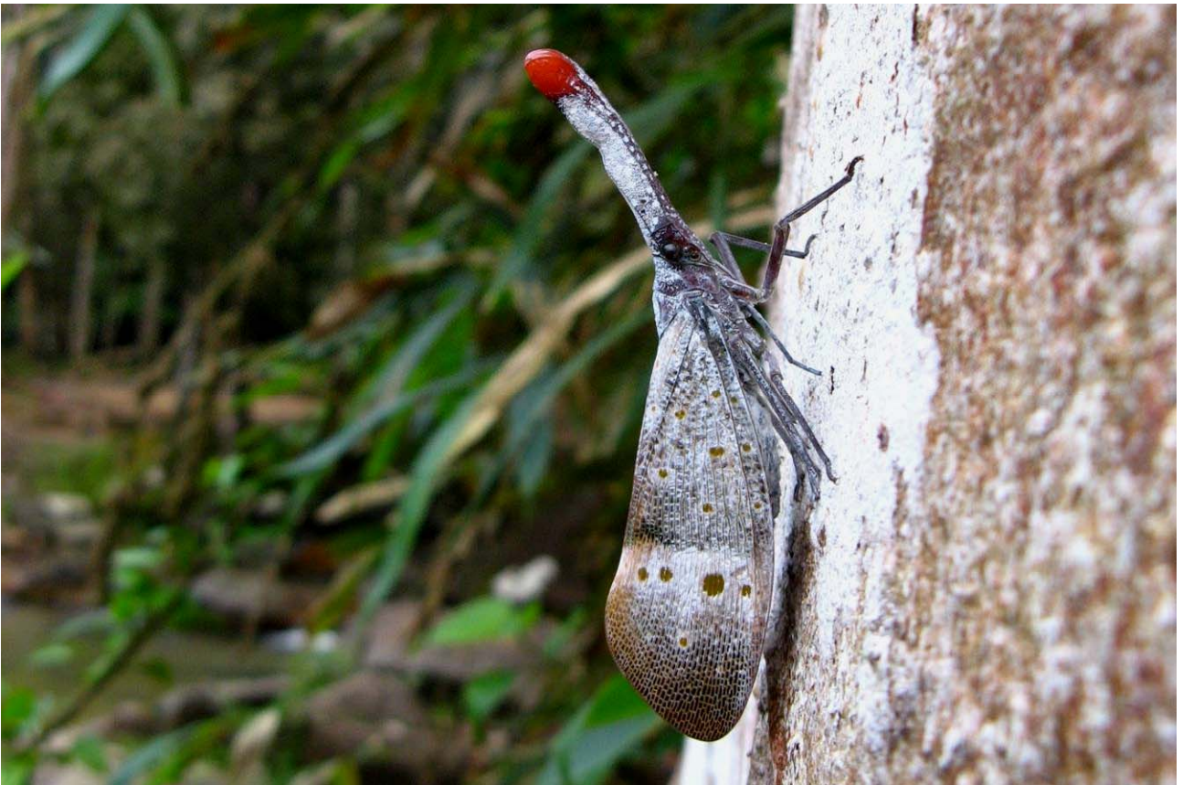
Fig. 6. Lateral view of Laternaria ruhli (as in Fig. 5). Note camouflage patterns intended to blend with pale lichen on bark of tree.